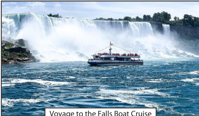
Voyage to the Falls Boat Cruise