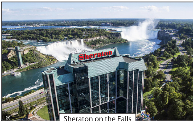
Sheraton on the Falls