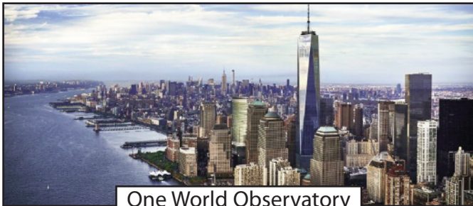
One World Observatory