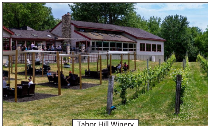
Tabor Hill Winery